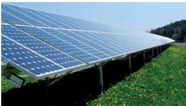
1 MW, Wirbenz, Germany

Jetion modules are particularly employed where long-term profitability, reliability and environmental issues are of great importance.